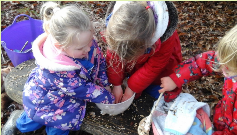
Making bird feeders at Forest School on Friday

Welcome to our first newsletter of 2017.